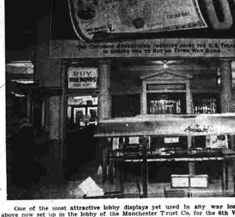
One of the most attractive lobby displays yet used in any war loan drive is the one pictured above now set up in the lobby of the Manchester Trust Co. for the 6th War Loan.