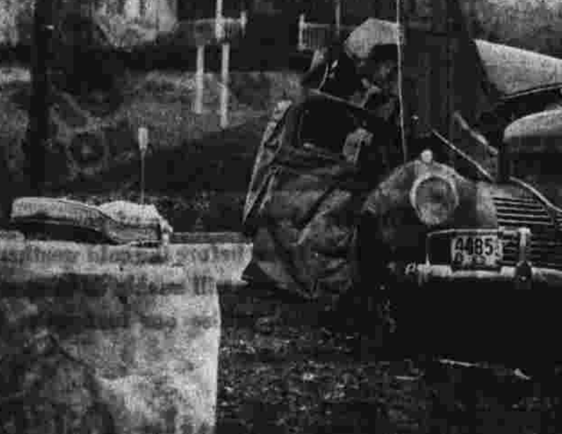
East Hartford Death Car at Manchester Green

The car was driven west along Middle Turnpike east, when for some reason about 150 to 200 feet from the car went out of control.